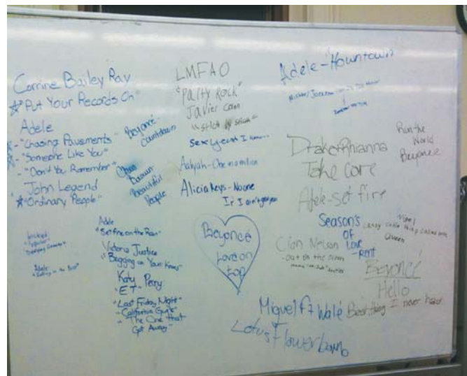
Figure 1: The White Board

1. Repertoire by Request: The White Board (and the Challenges of Pop Repertoire) We have a white board on which students are invited to write their sugges-